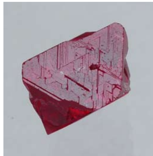
Fig. 6: Flux synthetic red spinel octahedron with triangular growth features on its surface.

Only careful observation with the loupe or microscope, and eventually sophisticated testing at a reputed gemstone laboratory such as the SSEF Swiss Gemmological Institute may tell the difference between natural and synthetic.