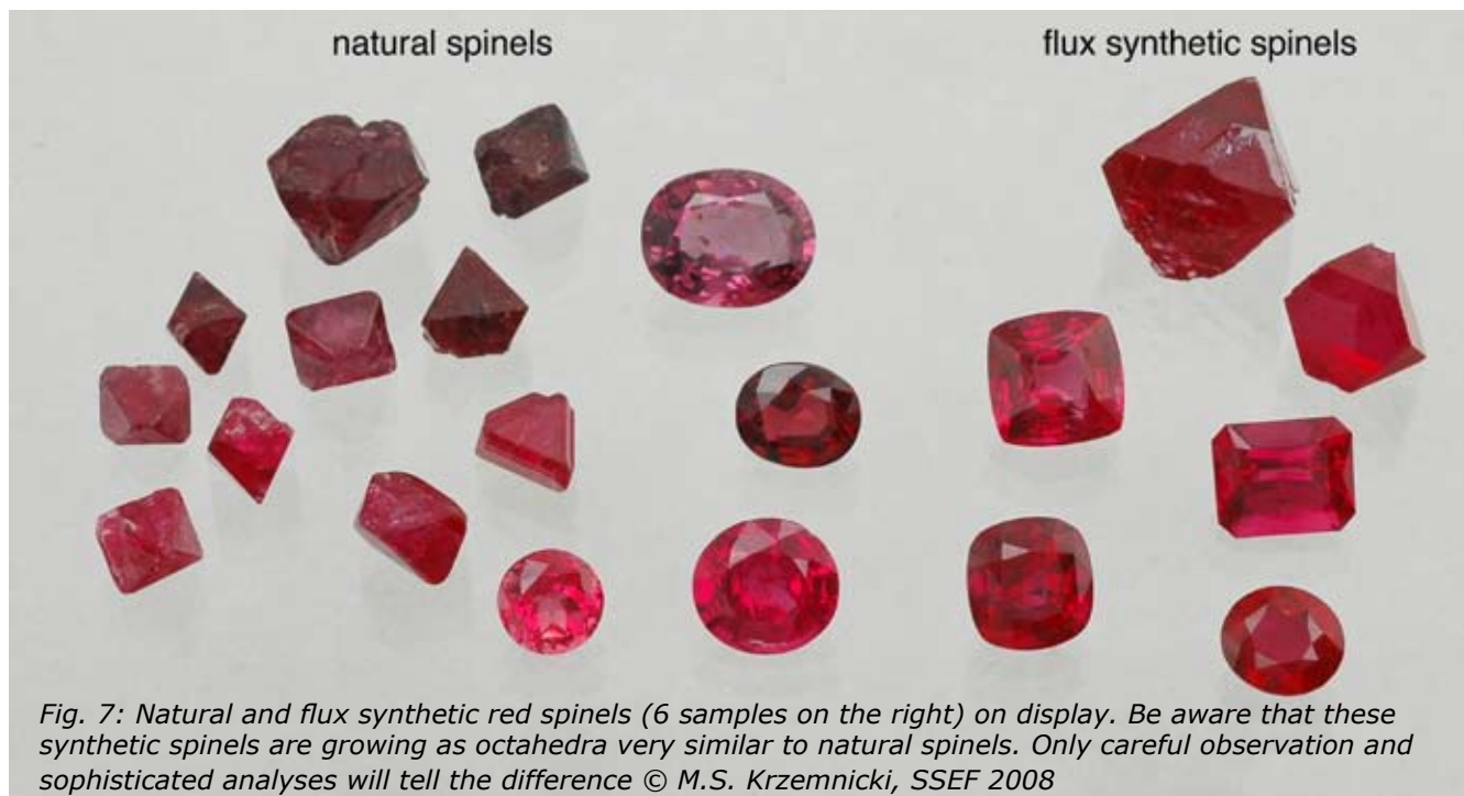
Fig. 7: Natural and flux synthetic red spinels (6 samples on the right) on display. Be aware that these synthetic spinels are growing as octahedra very similar to natural spinels. Only careful observation and sophisticated analyses will tell the difference

Schaub P. (2004) Spektrometrische Untersuchungen am Al-Spinellen, (unpublished diploma thesis), Mineralogical Institute of the University of Basel, Switzerland