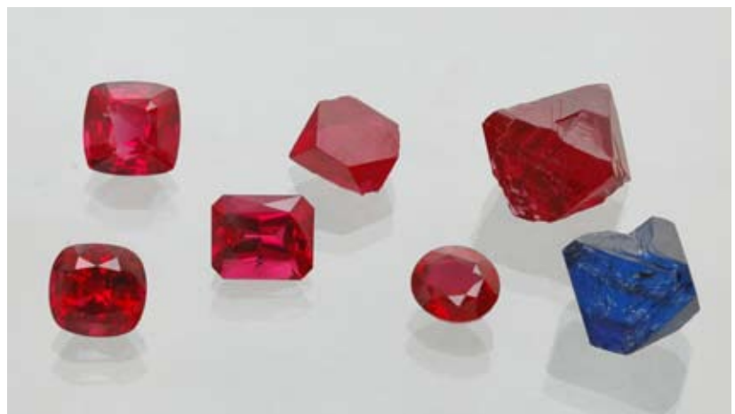
Fig. 2: Faceted and rough flux synthetic spinels. The octahedral crystals have been produced in Russia in the early 90ies. The colour of the blue crystal is due to cobalt. Although not seen this time in the market, blue flux synthetic spinels may also appear again in the trade.

When analysing these flux synthetic spinels with traditional methods, no difference is seen in RI ( \sim 1.717 ) and SG ( \sim 3.60 ) as for natural stones. The spectroscope is no help either, as both, natural and synthetic red spinels are coloured by chromium and show the same absorption lines ("organ pipes") and -bands. Between the crossed filters of a polariscope, the tested flux synthetic spinels all showed distinct anomalous extinction due to internal strain, which may also be observed in natural spinels, especially around inclusions. Under LW and SW ultraviolet, the stones generally exhibit a distinct orange-red fluorescence, sometimes slightly chalky yellowish orange along facet edges. But again, a safe detection based on these observations is not possible.