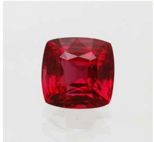
Fig 1: Flux synthetic spinel of high purity and well-saturated colour.

With the appreciation, which fine quality red spinels are seeing nowadays in the market, it is not astonishing that these synthetic spinels have shown up just now again. Different to flame-fusion synthetic spinels (e.g. by Verneuil-process, mostly light blue, yellowish-green, and colourless), the investigated flux synthetic spinels are very convincing and similar in appearance to natural spinels of best quality. Only by meticulous microscopic observation and chemical analysis, their synthetic formation may become evident. As their identification is difficult if not impossible for the normal gemstone dealer, testing of spinels by a reputed gemmological laboratory becomes an issue nowadays.