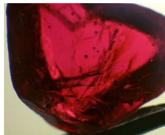
Fig. 5: Natural spinel from Myanmar with yellow and colourless crystal inclusions, small negative crystals and some fissures.